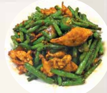
Mala Green Bean w. Chicken