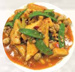
Dry Braised Tofu