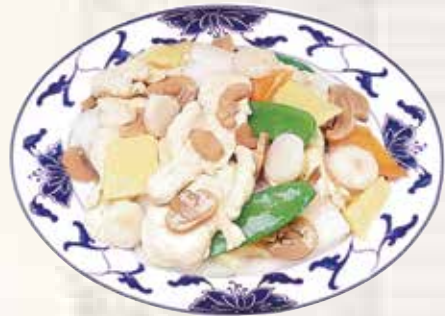
Moo Goo Gai Pan