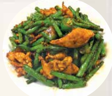
Mala Green Bean w. Chicken