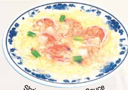
Shrimp with Lobster Sauce